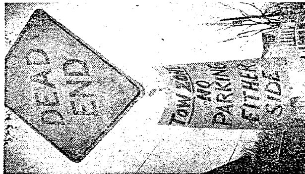
Cardboard signs warning patrons of Buckleley's Inn have been put by Clifton residents unhappy with congestion.