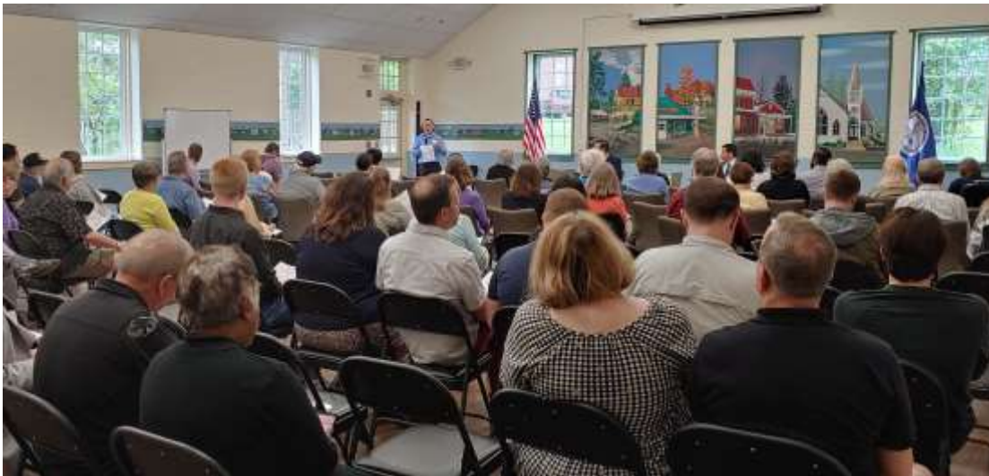
DWCNV Democratic Candidate Forum May, 2023

For more information about our organization and activities, visit our website http://www.democraticwomenofclifton.org/ and our Facebook page at http://www.facebook.com/DWCNV . Also feel free to email any questions to cliftonwomendems@aol.com . We hope to hear from you.